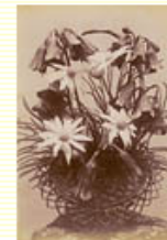
Christmas Bells & Flannel Flowers More Information Add to favourites