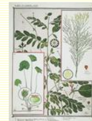
Exocarpus cupressiformis (Native cherry), Breyenia oblongifolia, Actinotus minor (Small flannel flower... National Library of Australia More Information Add to favourites